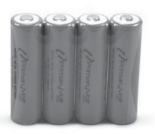
Rechargeable AA BaseBackupBatteries 4 Pieces Part #atstntbasebat4 $29.99